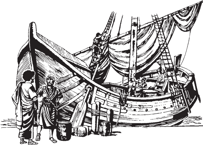
Yona naaniina bwatj kughenda Talasiisi (1:3)

haa mwalo, aasang'o bwatj bunamulito mbughenda Talasiisi. Aasasula sente sya lughendo, aaniina mu bwatj obu, dumbi baamukiya, Yona neelikana ati alimaaluka MUKAMA LUHANGA.