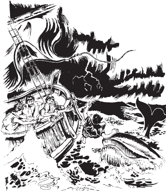
Baluki mbakuba Yona mu nanja (1:15)

17 MUKAMA LUHANGA akaba ateevaniye kisui kinamujito kumela Yona. Dumbi kyamumela. Munda ya kisui eki aamalamu bilo bisatu.